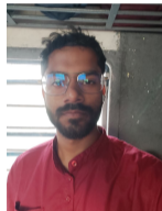
Shirshendu Basu Time Series Analysis Multivariate Analysis