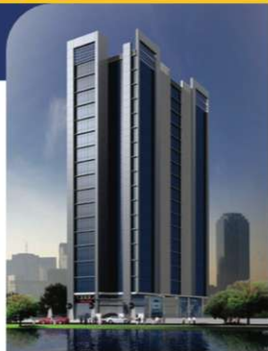
JIS INSTITUTE OF ADVANCED STUDIES & RESEARCH