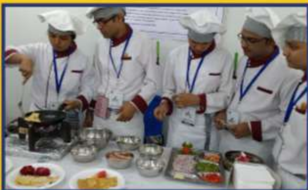
FOOD PRODUCTION LAB