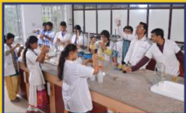
CHEMISTRY LAB 2