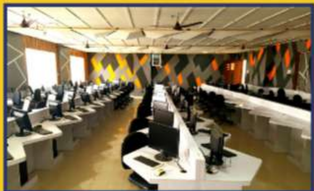
LAB OF ENGINEERING DEPARTMENT