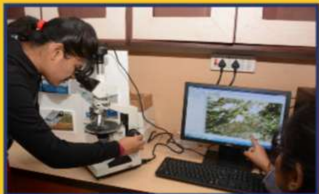
EARTH SCIENCE LAB