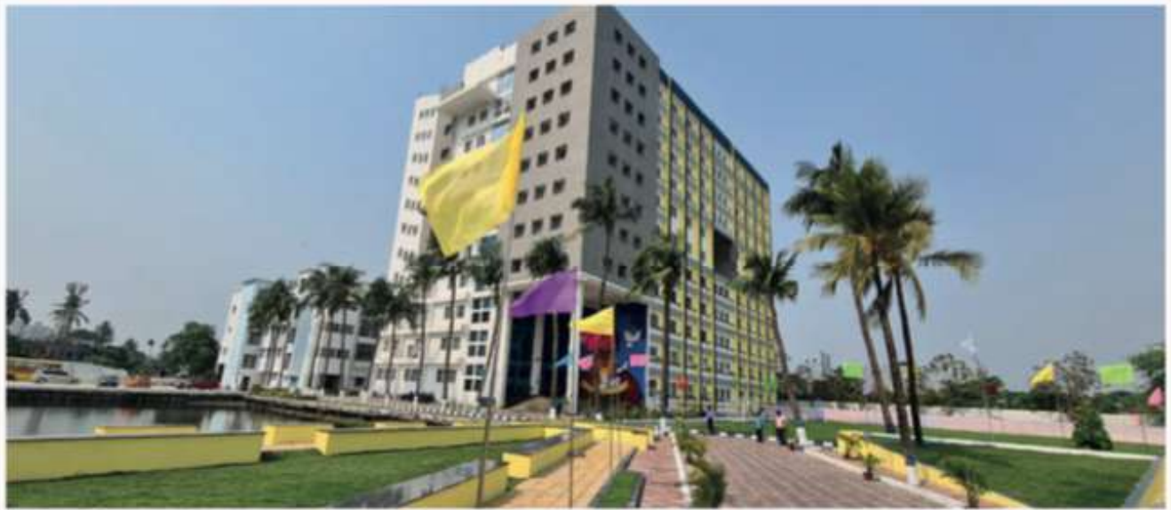
VIEW OF UNIVERSITY CAMPUS