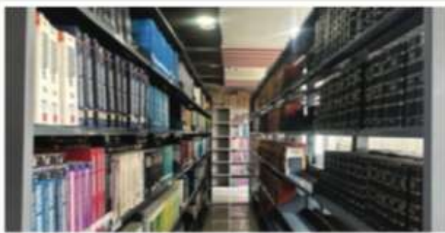
WELL EQUIPED LIBRARY