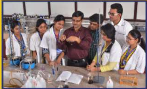
CHEMISTRY LAB 1